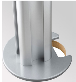
Grommet clamp AC-GC

Utilises an existing grommet hole or can be used as bolt through fixing. The plate provides extra stability for heavy loads. Fits grommet holes 60-80mm in diameter.