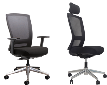
Featured with arms