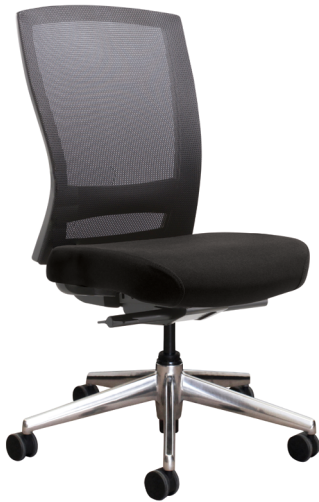
Buro Mentor chair with polished base