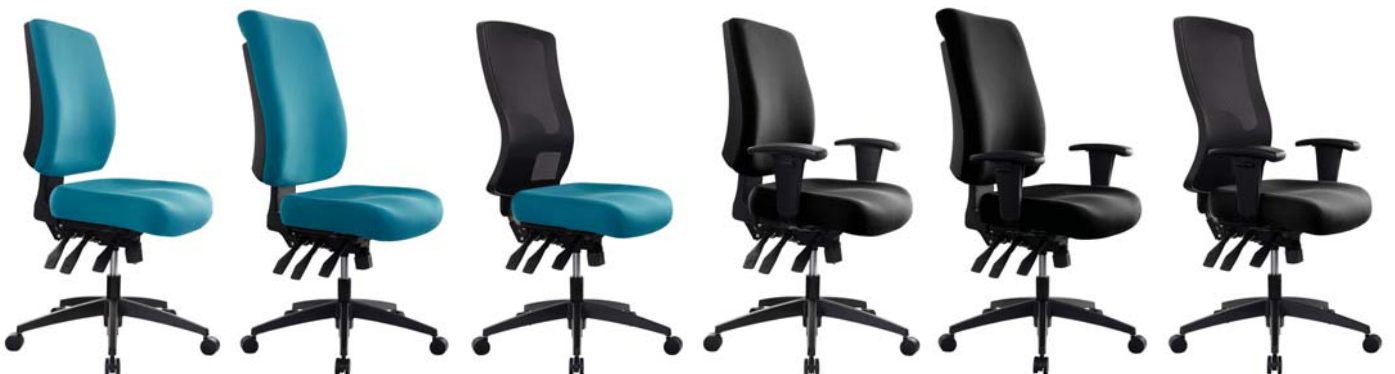
Mid Back Teal

The Buro Tidal series is proudly endorsed by the Australian Physiotherapy Association, is GREENGUARD certified & meets AFRDI Level 6 'Severe Commercial' certification*.