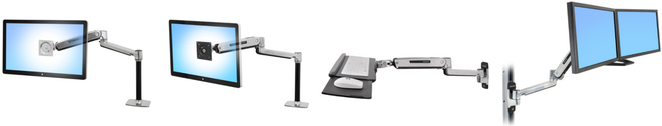
LX HD Sit-Stand Desk Mount LCD Arm

Combine existing product into exceptionally flexible monitor and keyboard systems. Industry-leading LX arms are even more accommodating for a range of personalized monitor and keyboard needs when joined into complete systems.