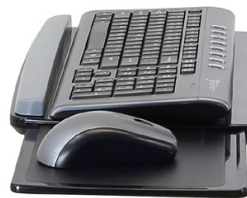
45-384-026 (polished aluminum)