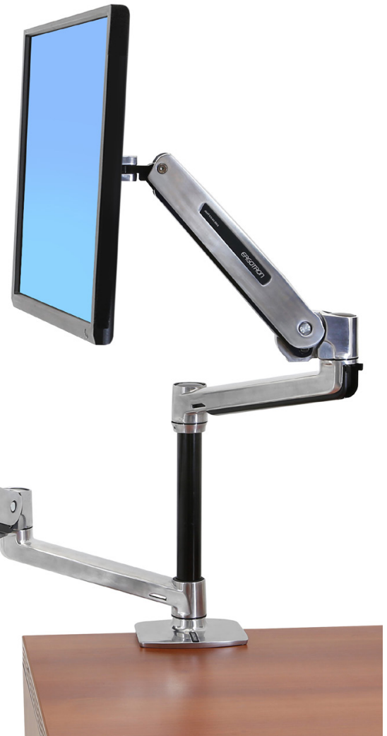
45-354-026 (polished aluminum)