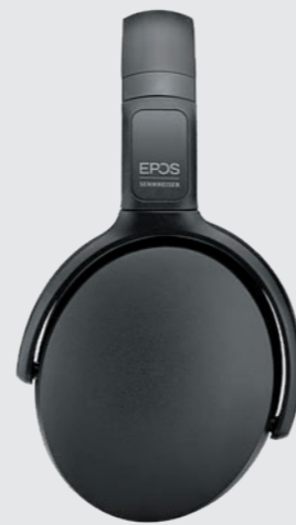
ADAPT 300 Series Over-ear, headset Wireless Bluetooth®