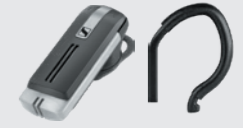
ADAPT Presence Grey Business