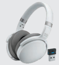
ADAPT 360 white