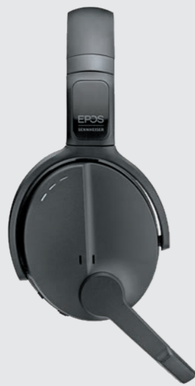
ADAPT 500 Series On-ear, headset Wireless Bluetooth®