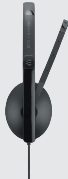
ADAPT 100 Series On-ear, single-sided and double-sided wired headset