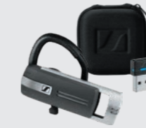
ADAPT Presence Grey UC