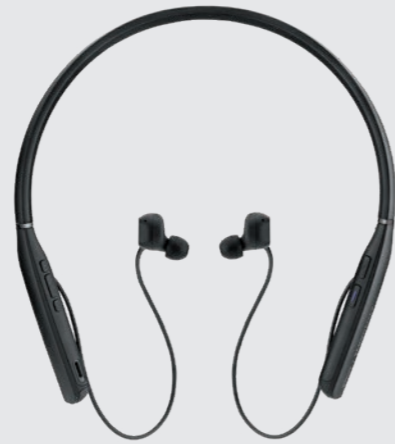
ADAPT 400 Series In-ear neckband headset Wireless Bluetooth®