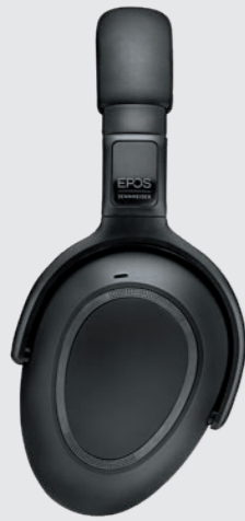
ADAPT 600 Series Over-ear, headset Wireless Bluetooth®