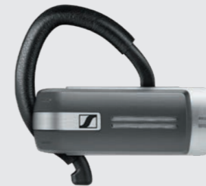
ADAPT Presence Series In-ear headset Wireless Bluetooth®